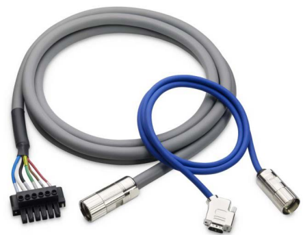
Figure C: Cable selection always matters for machine performance and precision.

A multiturn absolute encoder allows your system to know where it is, not only within the 360 degrees of a motor's rotation, but also how many times it made a complete turn in either direction.